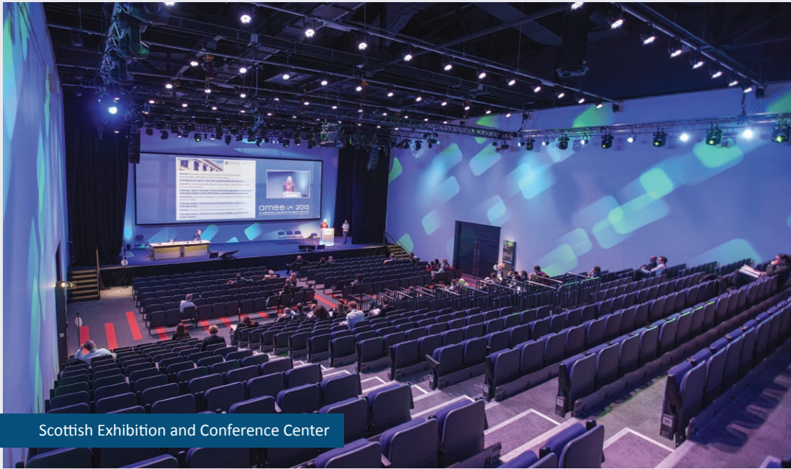
Scottish Exhibition and Conference Center

Education Museum Auditoriums Command Centers Museum Theme parks Corporate AV Military Education Government Stadiums Worship Centers Boardrooms Command Centers Corporate AV Theme parks Museum Stadiums Worship Centers