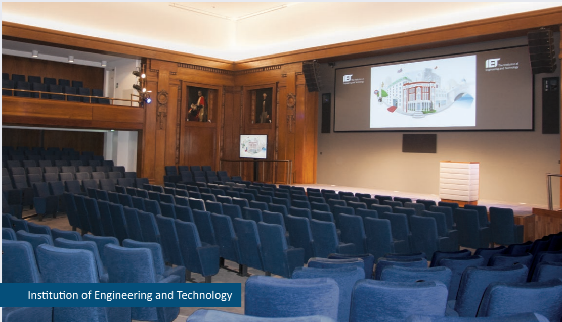
Institution of Engineering and Technology